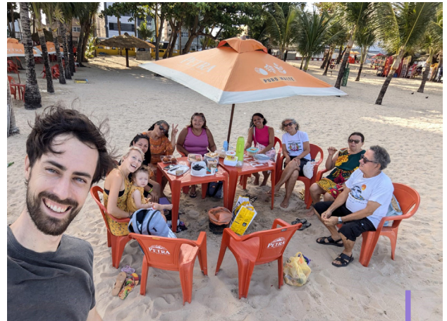
Taking the market team to the beach