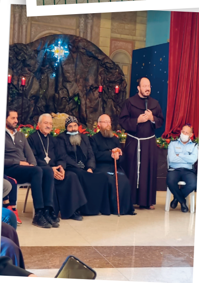
Photos from top to bottom: Clergy gather for the lighting of the Christmas tree; the Christmas market in Jaffa; all the local clergy, mayor, and city council representatives gather together on Christmas Day in an act of unity