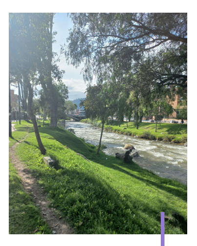
Our new church location

Since writing my last link letter, we have been going through a time of change in the church. After prayer and reflection in December, we took a step of faith and asked the Lord to lead us to a new church building which would enable us to reach those in the city centre and to be able to grow. This would require a bigger building in a new location – and all this for less rent! We began the search and with God's leading and guidance, our prayers were answered! God is good and faithful and we moved into our new building at the end of January!