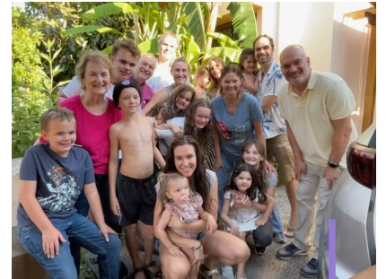
Photos from top to bottom: While we await retirement; new openings at the palace; 49 years of loving tenderness; the whole tribe together over the summer