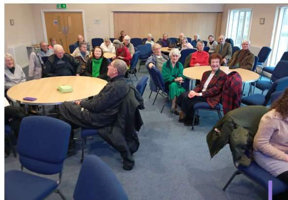
Students and residents of The Hope Revolution centre, where we held the training in South Africa

On my return I squeezed in participation at the UK ISAAC (International Substance Abuse and Addiction Coalition) conference in Bristol. There were many small organisations providing training, counselling, resources and Christian rehabilitation, most of whom had little awareness of the other groups with similar