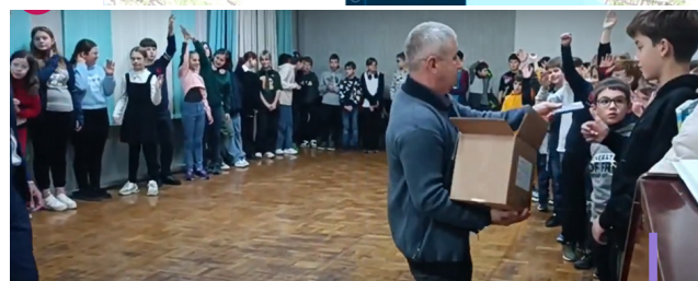
Photos from top to bottom: ISAAC conference flyer; a traditional Easter basket; the current front line, showing the occupied territory; children receiving Gideon Bibles