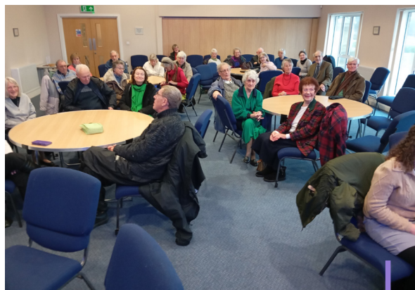
Students and residents of The Hope Revolution centre, where we held the training in South Africa

On my return I squeezed in participation at the UK ISAAC (International Substance Abuse and Addiction Coalition) conference in Bristol. There were many small organisations providing training, counselling, resources and Christian rehabilitation, most of whom had little awareness of the other groups with similar