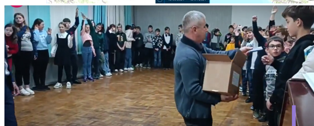
Photos from top to bottom: ISAAC conference flyer; a traditional Easter basket; the current front line, showing the occupied territory; children receiving Gideon Bibles