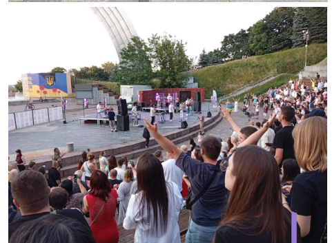
Photos from top to bottom: Blessing the young people at TLG; art therapy for children at a camp; March for Jesus and prayer at strategic sites; public evangelistic concert by the Arch of Freedom