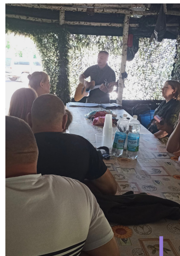
TLG chaplains encouraging soldiers

In addition to the suffering described above, doctors have noticed a large increase in the number of heart attacks, heart problems, strokes, cases of cancer and other terminal diseases. Lots of friends are having to undergo chemotherapy or have operations to remove growths. Friends and I have also suffered a rapid loss of teeth and crowns. I lost four last winter. Most people can't afford the luxury of medical insurance, so it is a huge burden on families to try and cover the cost when they get an alarming diagnosis. In TLG we have