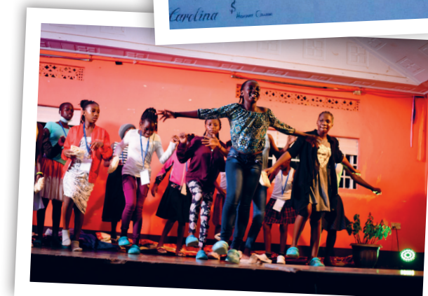
Photos from top to bottom: children participating in a dance class at camp; Ideal World poem written by children; children enjoying camp