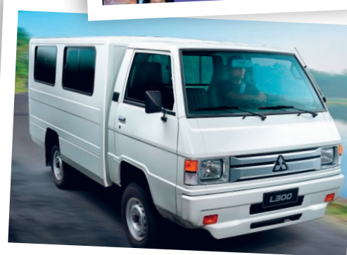
Photos from top to bottom: An apron made from a Jigsaw sewing pack; one of the Jigsaw online Bible studies; the brand-new Jigsaw van!