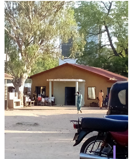
Main outpatients at Al Sabbah Hospital

My work at Al Sabbah Children's Hospital continues to challenge my clinical and managerial skills. We got running water on the ward for the first time a couple of weeks ago which was very exciting. Praise God for that breakthrough! I had planned some publicity among the staff about the importance of hand washing for the safe care of newborn babies but within 24 hours of getting the water sorted out, we had to vacate the ward completely to allow for some renovations to take place. It has been quite tricky to look after up to 26 mums and babies across four temporary rooms and a corridor with only 15 beds and no water again! Thankfully it will only last until the renovations are completed. Please pray that there will be no delays and we will be able to move back soon. I have 8–15 medical interns (doctors in their first year after finishing medical school) to help me on the ward but I get a new batch of these doctors every two weeks which means I repeat myself a lot! I am thankful for two lovely medical officers (doctors who have completed their internship training) who work incredibly hard and keep the ward mostly under control, especially on the days that I am