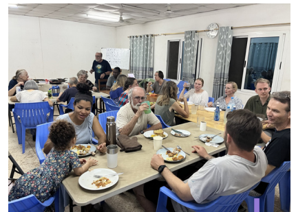
Photos from top to bottom: The neonatal unit at Juba Teaching Hospital, compared to...; ... the temporary neonatal unit at Al Sabbah, complete with "floor beds"; Christmas came to a Juba supermarket in early November; a combined Christmas and Thanksgiving meal with my neighbours