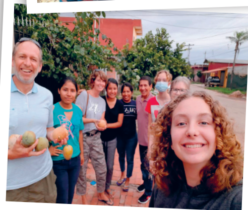
Photos from top to bottom: Rejoicing on reaching our hotel; locals on their way to their terrace farm; 18km hike smiles; visiting Satellite Norte families