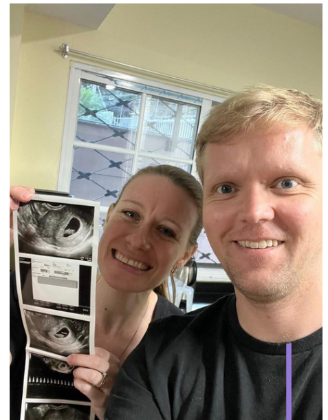
Photos from top to bottom: Many of the Proyecto Alas young people excitedly preparing to march in the Independence Day parade; Honduras celebrates Children's Day on 10 September, and Proyecto Alas celebrated with an afternoon of games, food, and lots of fun!; we are going to be parents!