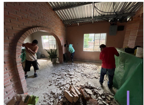
While the renovation process took much longer than expected, we are very pleased with the shiny new coffee shop (and bat-free roof!)

Support Lindsey and Steve Poulson: churchmissionsociety.org/poulson