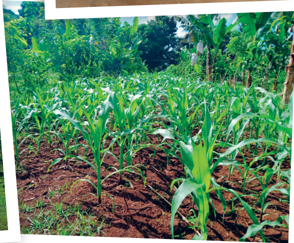
Photos from top to bottom: Lush syntropic interplanting of bananas, papaya, guava and cassava (we’re having lots of rain); Atiyah worked for the summer and bought a scooter!; experimental wood chip mulch on corn; the same crops two weeks later