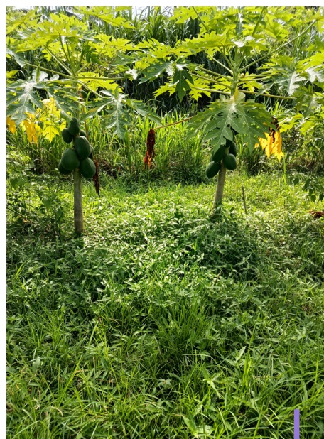
How the papayas should be looking