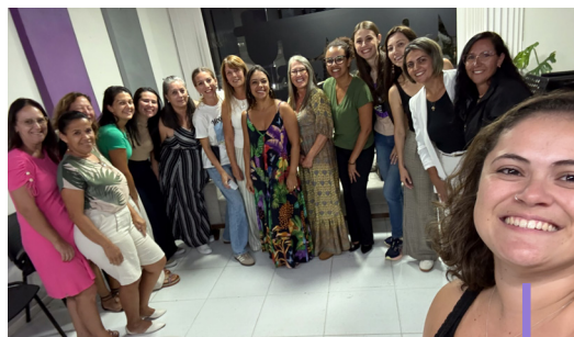
Shine, our women's meeting, in March