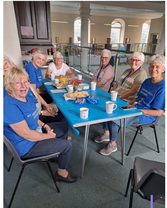
Trusted helpers from the summer activities.

I attended the end of term assembly for the children at Riverside School. It is a proud moment for many parents as prizes are received and awards given for achievement during the past year. Year 6 children are moving on to new schools and leaving behind being a primary pupil. The adult world begins for them and as usual there is a mixture of trepidation and excitement. The headteacher has completed her second year, which has been a challenging year for her and for the school. Once more we have reduced numbers for the coming academic year. This issue is not just for Riverside but also for schools across Plymouth and I suspect across many areas of the country. We have had to close our nursery temporarily as so few parents have applied for places for their children. We will open it up again when the numbers increase. This has meant