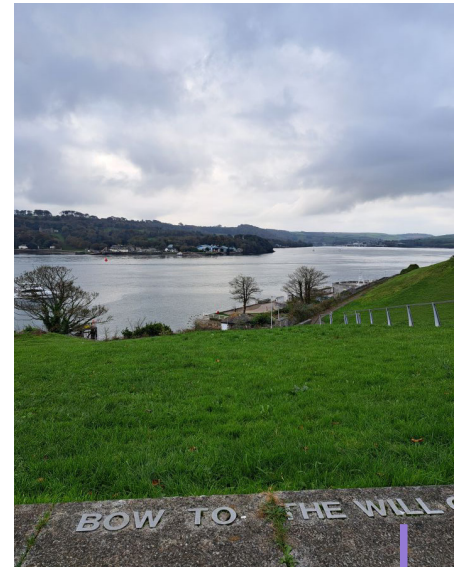
From Devonport, looking across to Cornwall

Since the beginning of the academic year, the connection with City College has developed. The lead chaplain has moved to another position, so I have been able to step up and get more involved. The major event of the autumn term is Remembrance. This year 30 veterans from Plymouth were invited to attend our Remembrance service and in total there were over 300 attendees, mostly students and staff. The public service students were tasked with organising the event and students took part by reading and also serving