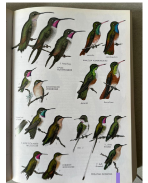
Photos from top to bottom: A winter morning; local foliage; eucalyptus trees; hummingbirds in Lima (illustration from Birds of Peru , Helm Field Guide)