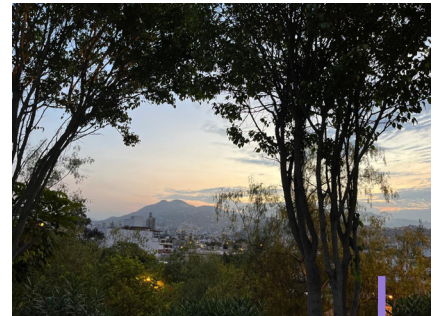
Easter sunrise 2024