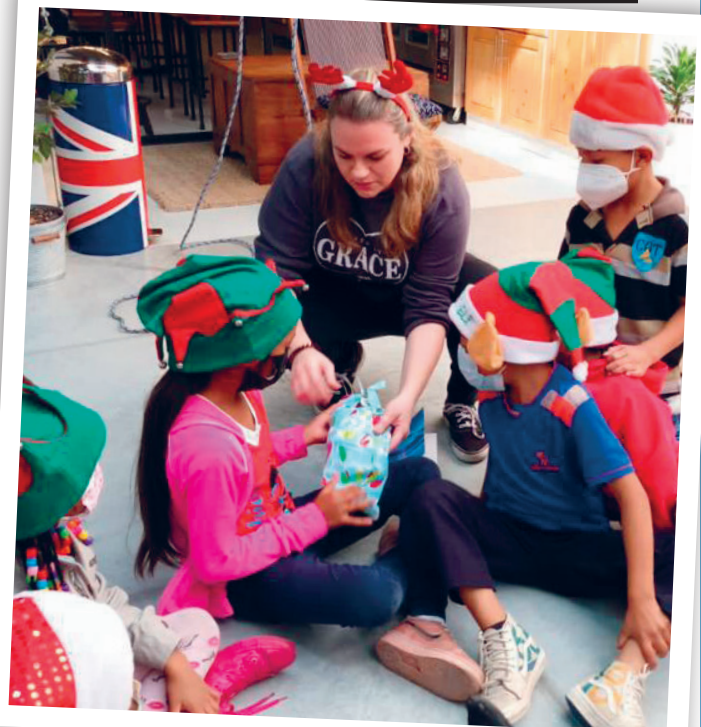
Telling the Christmas story with the children through pass the parcel

My role: Working with street-connected children and young people at risk in Guatemala City.