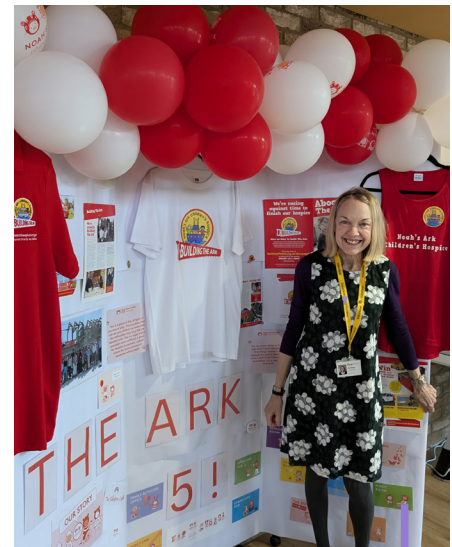
Celebrating Noah's Ark's fifth birthday

I took a solo pilgrimage to Walsingham Abbey in Norfolk, the only Marian Catholic shrine in the UK, for a