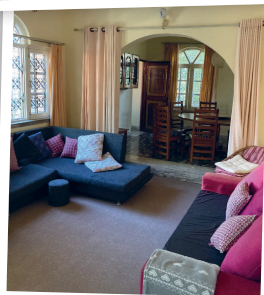
Photos from top to bottom: Traditional Doshain swing; Students making a mandala for Tihar celebrations; A little haven of green behind our house in Kathmandu; A place of welcome and prayer.