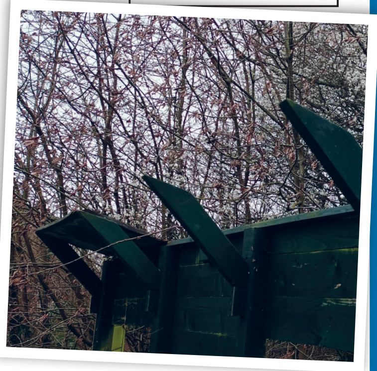
Bird hide damaged by storm

Our role: Building bridges among different faith communities through environmental projects and activities.