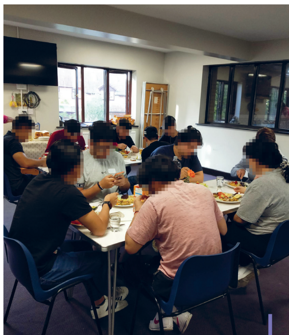
A meal for refugees at my home church, at which those from different places cooked and shared traditional foods.

The church has been the main organiser (with help from other churches) of a Jubilee celebration for 5 June. As I write this that is still two weeks away, so I will share what happened in my next newsletter.