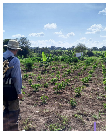
Simon in the coffee nursery garden

Our new classrooms are gradually going up, and we await funds only for the iron sheets and plastering.