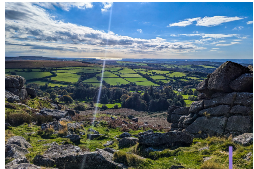
Enjoying nature in the UK.

One of the greatest joys of this experience was working with the children and youth, helping them grow in their faith and understanding of God. It was a privilege to witness their enthusiasm for learning and their desire