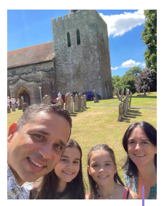
Visiting our link churches in the UK

We were also able to visit and share at a youth club at our local church and a Girls' Brigade group at another link church. We were impressed by how the youth really connected with the stories of the girls we work with at ReVive. In January a Girls' Brigade group made cards and wrote to the girls at ReVive. This time, when they heard about Conscience Club, they created gifts from recycling and prayed for the girls at ReVive. It is great