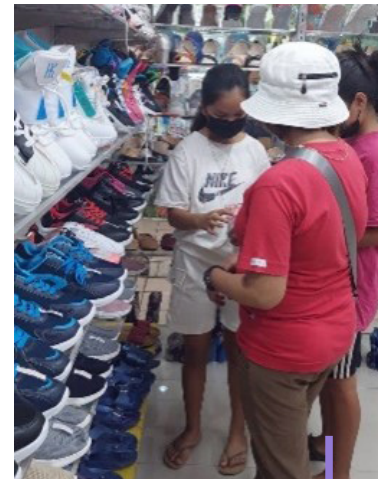
Photos from top to bottom: One of many home visits during Jigsaw's visiting month; girls practising their writing skills; new shoes for school, made possible through Jigsaw's education sponsorship