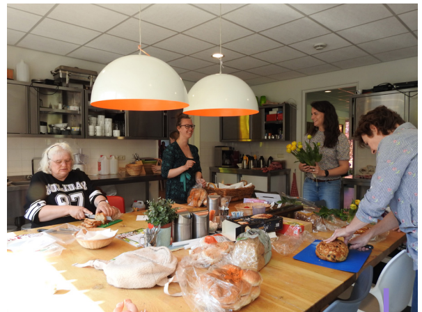
Het Pand community prepare food in the kitchen.

And then it is celebration time. This time I am in charge of leading it. The theme is: God's goal with creation. We are living in God's gift for us, a beautiful world. But also a world in pain and chaos. In Luke 14 Jesus tells us that God continues to realise his plan for this world. He compares it to a feast, where all are welcome, and especially the poor, the rejected, the outsiders, those who are not welcome in other places.