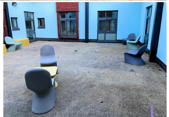
Photos from top to bottom: Scrap wood Christmas trees in the making in the shed; finished scrap wood Christmas trees; gathering around the fire pit on a cold December day in Carlisle; hospital space to fill with woodwork from the shed