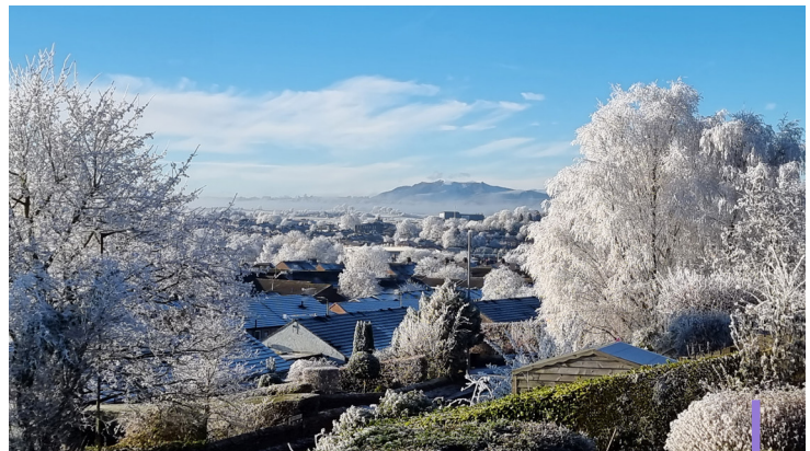
The view from my home in Penrith, December 2022 is up there with the best views in Africa. Thank you Lord!

As Christians we know Jesus is the answer. The good news gives perspective and strength to endure, even to overcome SAD! I draw strength from my African friends' example, ultimately Jesus' example. I hope with