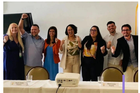
Ceremony marking the implementation of a fostering service in Olinda

RECAP was established two years ago by a group of Christian lawyers and exists to serve popular movements, social organisations and churches. We give support and legal advice based on Christian values and human rights. RECAP now has 125 members, including lawyers, law school students and professors and we are already