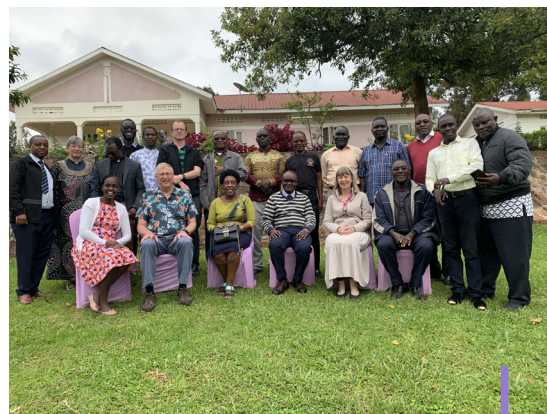
The first phase of lecturer training at Uganda Christian University, Kabale.