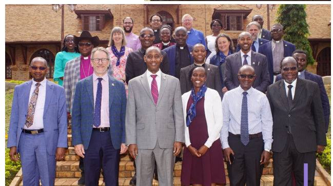
Photos from top to bottom: We've been training in Uganda, Brazil and Indonesia!; At the Africa Mile Deep Strategy meeting.