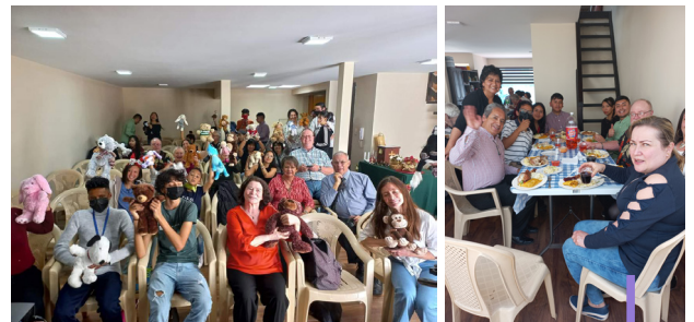
Christmas Day at Cuenca Christian Church

God is blessing his church right now. We have had several mature Christian couples from the USA and Canada arriving in the first three months of this year and one couple from Bible seminary wanting to support