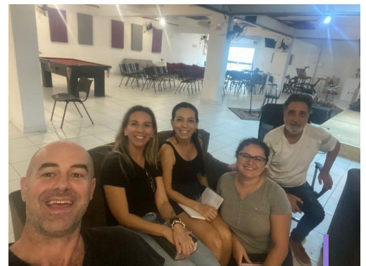
Photos from top to bottom: Wednesday night with familia de Cristo; Sunday service at Vineyard Floripa; preaching at a Sunday service; volunteers at the church training for prison ministry