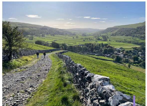
The beautiful Yorkshire Dales have been a place to rest and prepare for our next chapter.