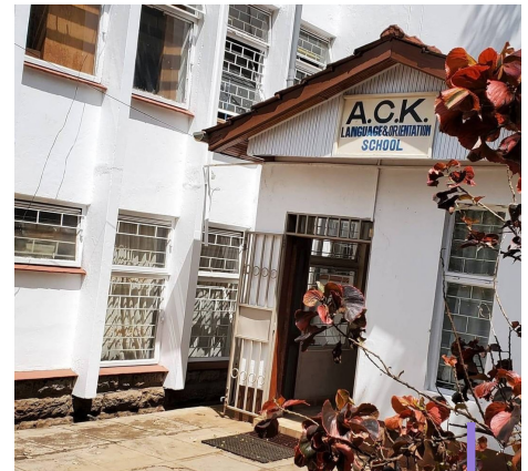
ACK Language and Orientation School