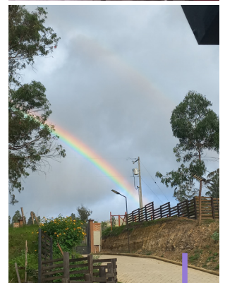
Photos from top to bottom: Orchid Project students Pedro and Linda exchanging Christmas gifts at church; a happy bride and groom and a double rainbow in Loja