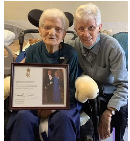
My mum celebrating 100 years!

We therefore had to cancel our mission training for the weekend in Swindon, but we did manage to improve enough to attend the PiM conference the following Tuesday in Northampton, albeit suffering with post-flu coughs and tiredness, before we headed back via Oxford to LHR and to our onward flights to Cuenca. It took a couple of weeks for us to get back to full health and a visit to the local medical centre confirmed that I had a bad throat infection and hives, which was particularly irritating.