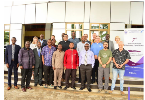
Participants AMDS 2024 Dodoma

During 2023, Alexandria School of Theology (Egypt) and Uganda Christian University completed the short course in teaching and learning and were issued with their certificates. They were delighted to receive them. The dean of UCU reported that the Ugandan government has made it compulsory for all university