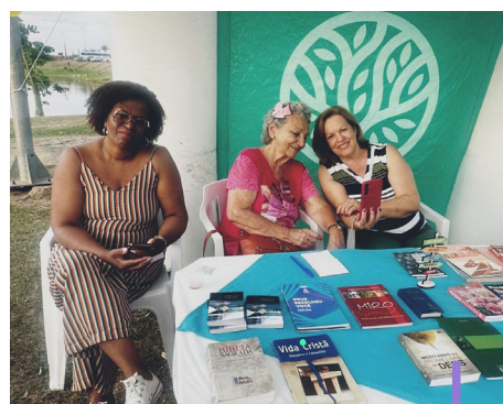
Many people are overjoyed receiving free books. One lady received her first Bible at our book stall.