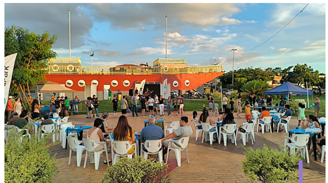
A view of our community settled getting ready for a quiz and games