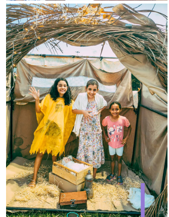
Photos from top to bottom: 35°C weather – cooling off with water games!; clowns made Children's Day festivities so much fun; our four wise men prepare to go on stage with their gifts; some of our Nativity actresses in the stable